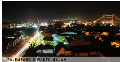
PALEMBANG DIWAKTU MALAM