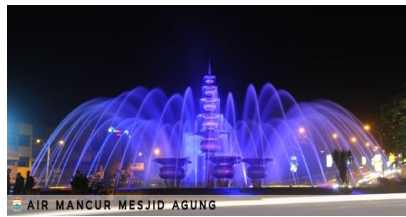
AIR MANCUR MESJID AGUNG