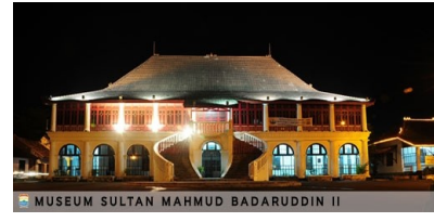
MUSEUM SULTAN MAHMUD BADARUDDIN II