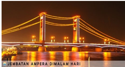
JEMBATAN AMPERA DIMALAM HARI